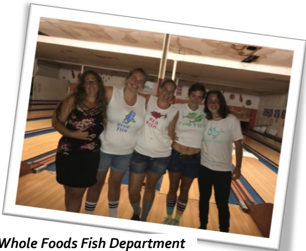
Whole Foods Fish Department