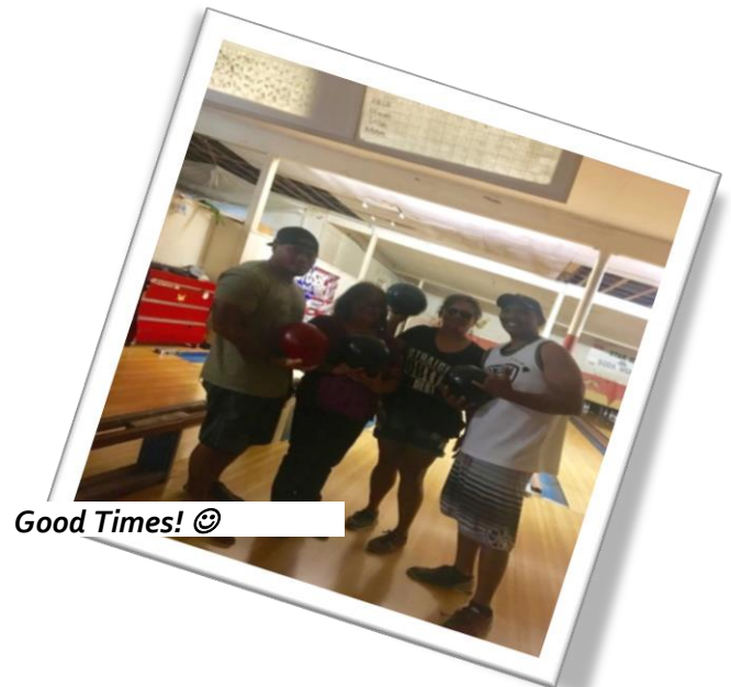
Good Times! ☺