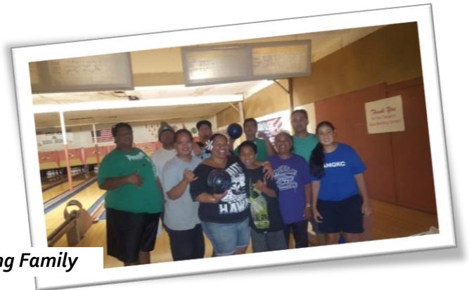
A Bowling Family