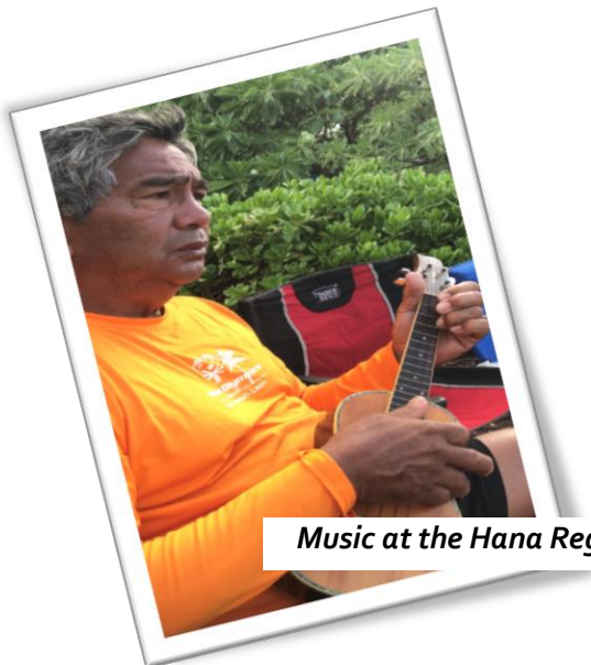
Music at the Hana Regatta